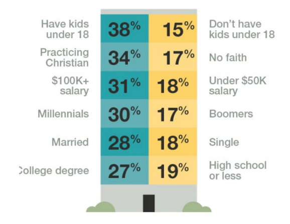
Celebrate birthdays or holidays with neighbors